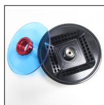
EZEERotor-0.2 8 x 0.2ML PCR STRIPS