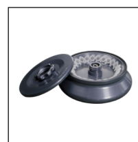
EZEERotor-2* 24 x 1.5/2ML TUBES

*Standard EZEEfuge package includes EZEERotor-2