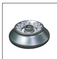
EZEERotor-5 12 x 5ML TUBES